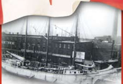
Clipper tea ship docked at Market Wharf, Saint John - circa 1900

King Cole tea has become the company's premiere product and the leading brand of teas sold in the Maritimes, while available coast-to-coast across Canada.